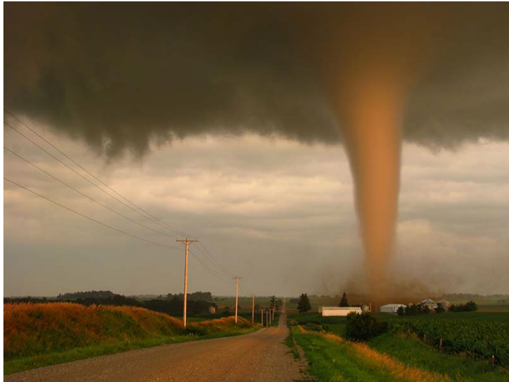
Tornado near Iowa farm