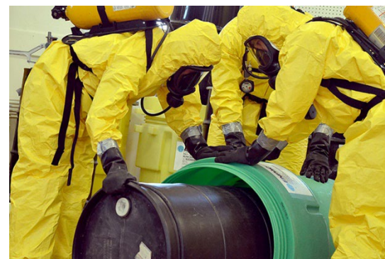
Haz Mat Team

https://homelandsecurity.iowa.gov/programs/lepc/