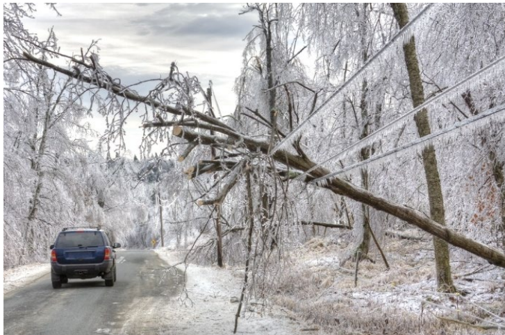
Ice storm impacts power lines